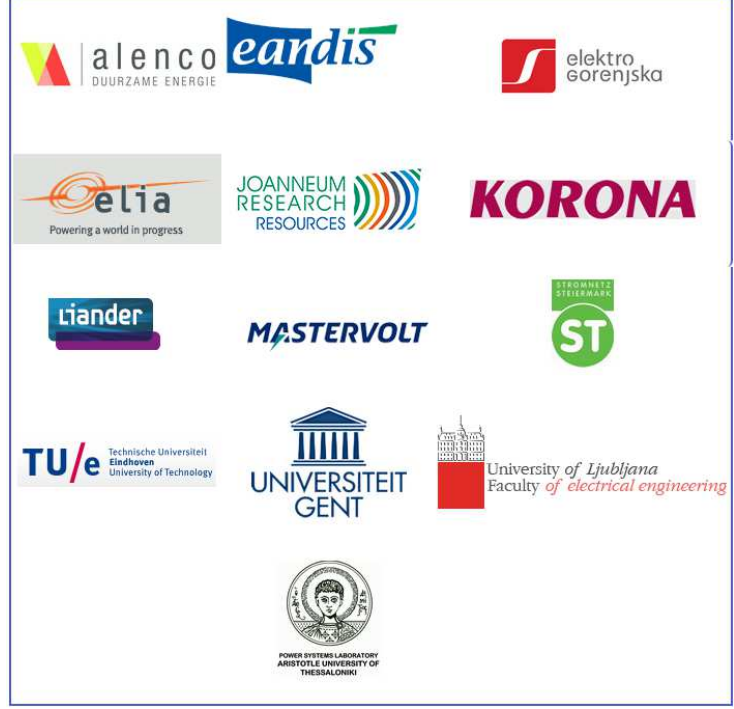
Figure 3: Logos and links to partners (see section who we are)

By clicking the partner logo the user is directly linked to the partner webpage. These links enable visitors, but also project partners, to find additional information about the project consortium and other relevant links, projects etc..